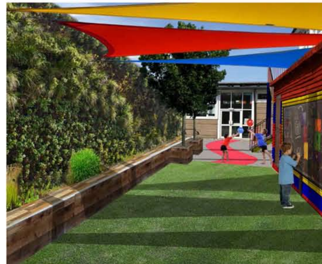
Proposed view of the green wall