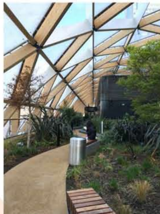
(Below) Crossrail Place Garden