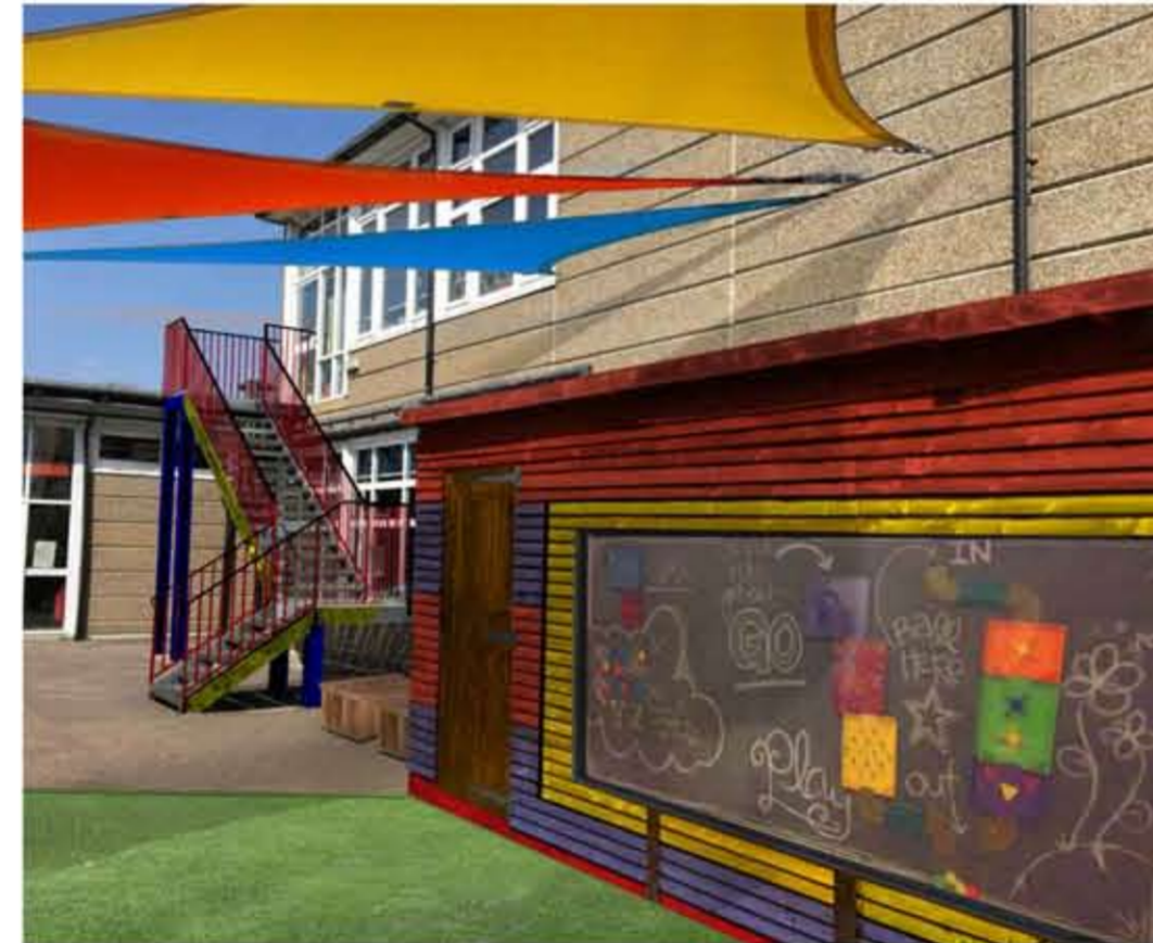
Proposed view of outdoor teaching area

Following on from the survey exercise we discussed what methods we could employ to resolve the issues that we had discovered, during this exercise we discussed other projects that have responded to similar issues. Following a recent trip to the gardens at Crossrail Place I showcased this scheme to the class and discussed how the different paths provide a different appreciation of the gardens, by slowing pedestrians down it encourages a greater appreciation of the adjacent landscape. We also looked at the types of 'feelings' that we would like to create within the space, the current space is used as an outdoor corridor that is used to for pupils to get from the school (dinner) hall out into the playground. The children's idea was to introduce elements into the space that would slow people down and allow for a greater enjoyment as they passed through.