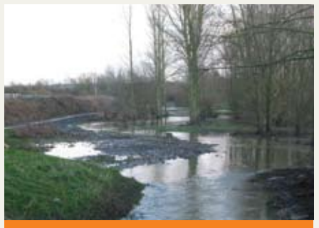
The River Ray Corridor, Swindon