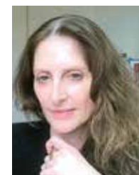
Sue Morgan Landscape Institute