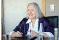
Saskia Sassen Columbia University

Saskia Sassen is the Robert S. Lynd Professor of Sociology and former Chair, Committee on Global Thought, Columbia University. Her books include Cities at War with Mary Kaldor (Columbia University Press, 2020); Expulsions: Brutality and Complexity in the Global Economy (Harvard University Press, 2014; translated into 12 languages); She is the recipient of diverse awards and mentions, multiple doctor honoris causa, named lectures, selected for various honors lists.