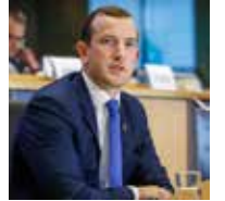
Virginijus Sinkevicius European Commission

Virginijus Sinkevicius is the present Commissioner for the Environment, Oceans and Fisheries, at the European Commission. Mr Sinkevicius was from 2017 to 2019 Minister of Economy, and before he was leading the Committee of Economy at the Parliament of Lithuania. Mr. Sinkevicius was elected to the Parliament in October 2016. Prior, he was a Team Lead for Regulatory Affairs at Invest Lithuania. Mr. Sinkevicius holds BA in International Relations and Affairs from Aberystwyth University and Master's degree in European International Affairs from Maastricht University.