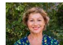
Rebecca Pow Defra

Rebecca Pow is the Member of Parliament for Taunton Deane and Parliamentary Under Secretary of State at the Department for Environment, Food and Rural Affairs. In 2018, she was awarded a Green Heart Hero Award by The Climate Coalition, a coalition of over 100 charities and community groups across the UK, for being the "Greenest New MP" for her environmental work. She was instrumental in gaining extra protection for ancient woodland and veteran trees; bringing forward the ban on microbeads and for getting soil health on the agenda.